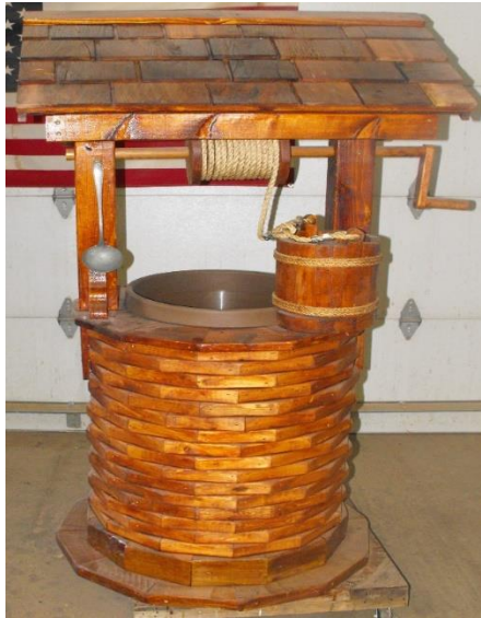
Handmade Garden Wishing Well 5' tall x 3' wide (Value $500)