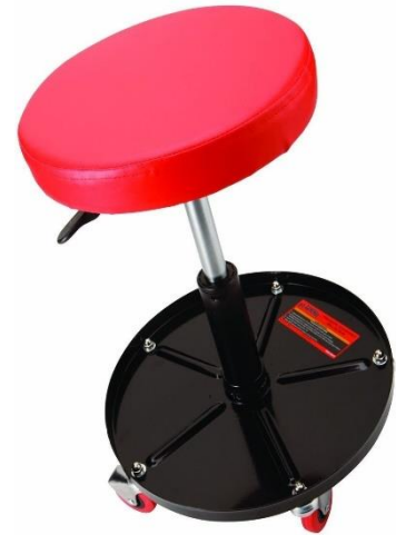
Pittsburgh Pneumatic Roller Seat 15-20" (Value $40)