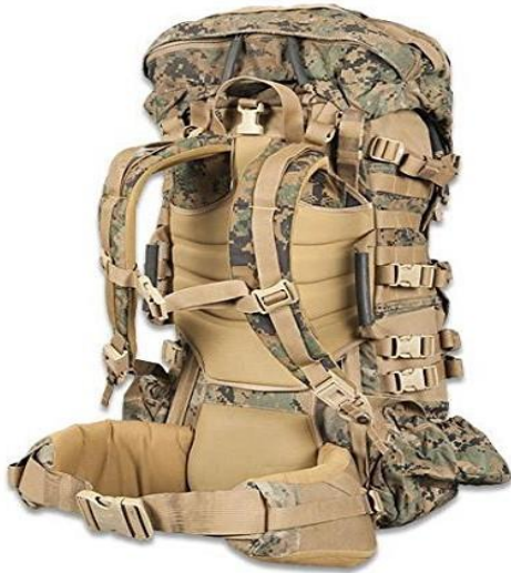
USMC Propper Arcytery'x ILBE System w/main pack, assault pack & hydration system (Value $400)